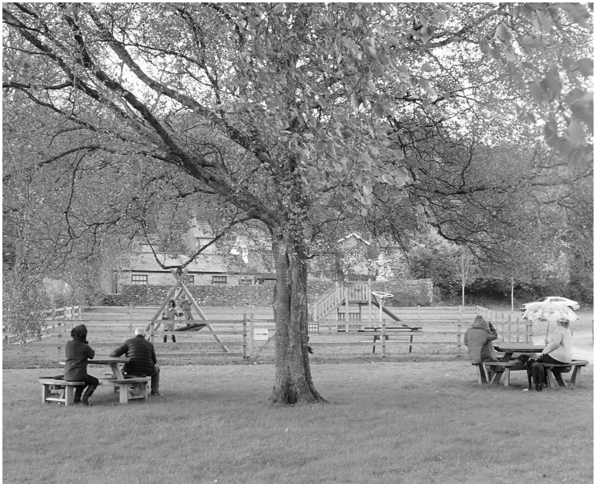
The Meadows green and play area

Yealand Storrs has doubled in size in the past few years, with the conversion of the farm buildings which were once part of Yealand Hall Farm, into seven dwellings.